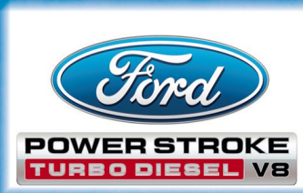
6.4L, 6.7L Diesel